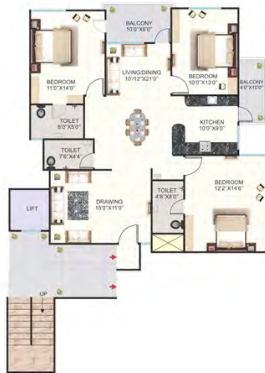
Sr. MIG (2BHK) FLOOR PLANS